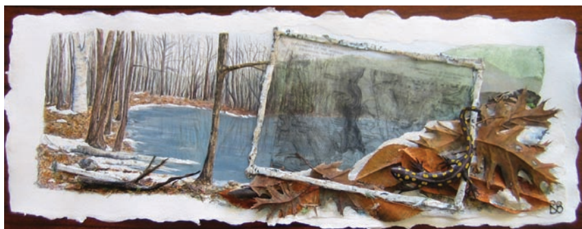
Arrival at the Vernal Pool , 2010 watercolor, glue, acrylic on paper 10" x 28" $6,000