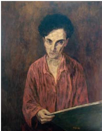
Self Portrait , 1947 (cat. 13)

Donc le poete est vraiment voleur de feu Rimbaud in a letter to Paul Demeny, 1871