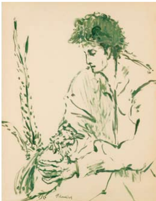
Man with Pheasant , c. 1955