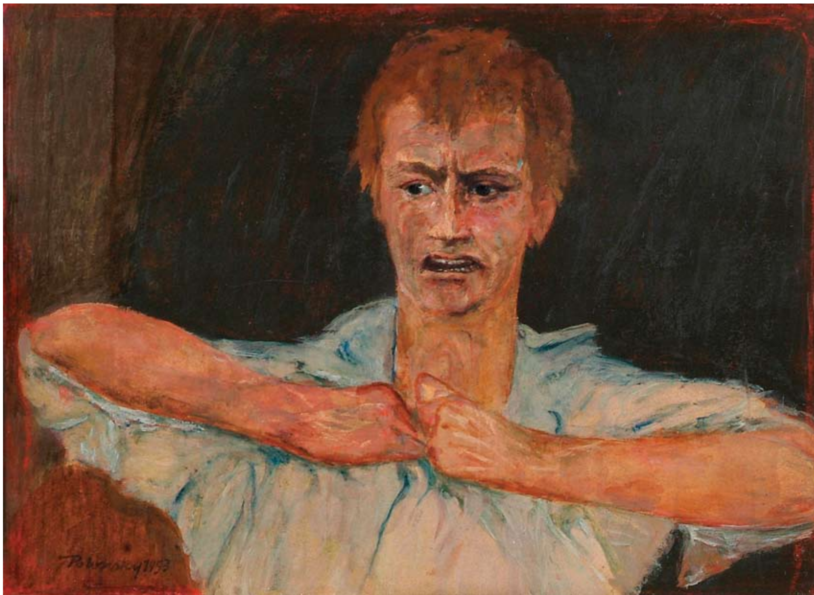
Raging , 1953 (cat. 15)