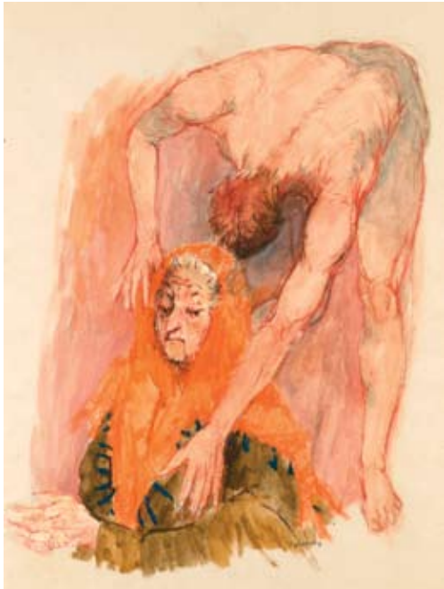
Memory , 1955 (cat. 16)