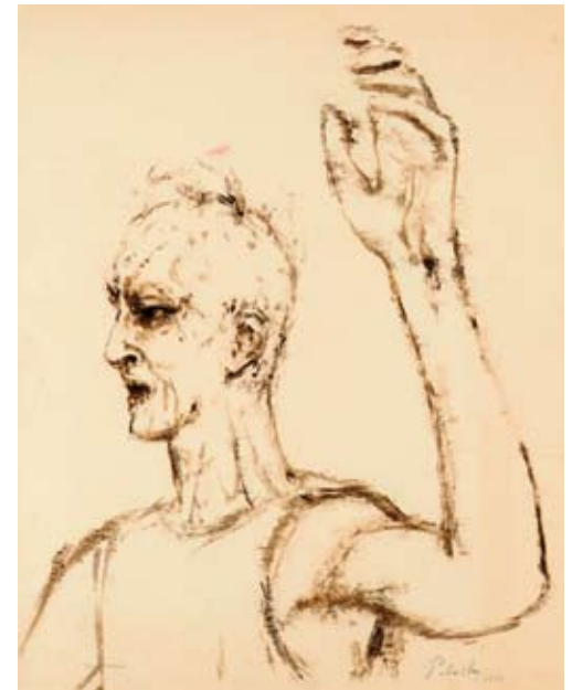
Untitled, 1951 (cat. 34)

Polonsky was able to create a visual metaphor for this fire. Nearly all of his paintings feature a source of light – perhaps because of the artist’s delight in contrast, perhaps in reference to a creative spark that must be stolen from the gods. He registers desire and caution for this inspiration through a complicated allusion to poetry and myth. Rimbaud wanted to be “the son of the sun,” and Samson’s name means “of the sun.” Both were powerful, but